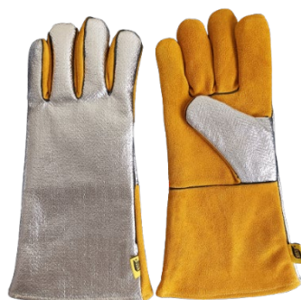
Heavy Duty Aluminized

A comprehensive range of professional heavy-duty MIG / MMA welding gloves with premium materials and upgraded features and options. From a simple, occasional-use split leather Stick welding glove such as the M1050, right through to the M3050 premium, all-day MIG glove, the ESAB heavy duty range covers all levels of welding protection.